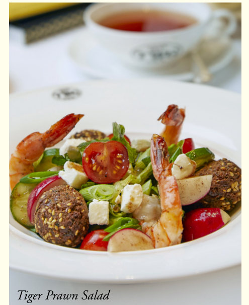
Tiger Prawn Salad