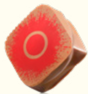
1837 Green Tea, Raspberry & Caramel