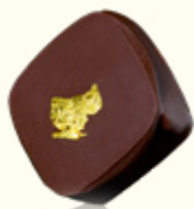
Earl Grey Fortune, Dark Chocolate Ganache