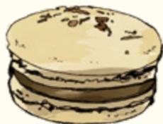
Vanilla Bourbon Tea & Blackcurrant