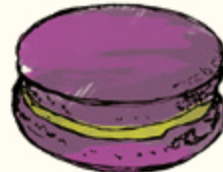
Grand Wedding Tea, Passion Fruit & Coconut