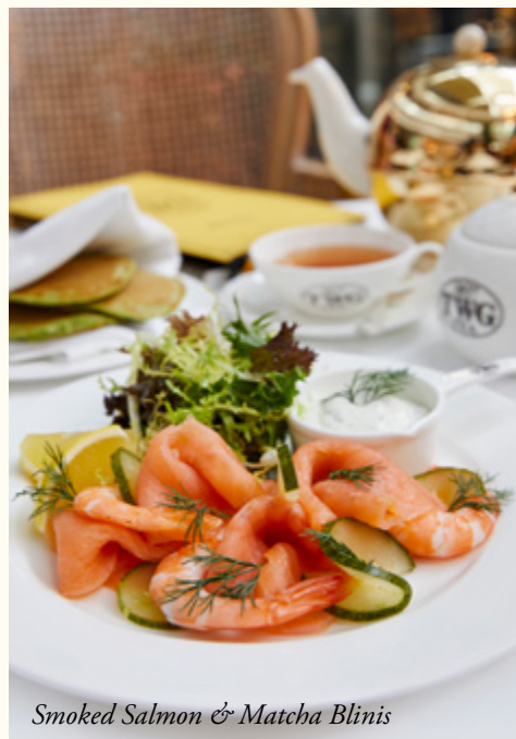
Smoked Salmon & Matcha Blinis