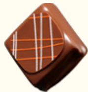
Polo Club Tea, Chestnut & Apricot