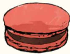
Bain de Roses Tea