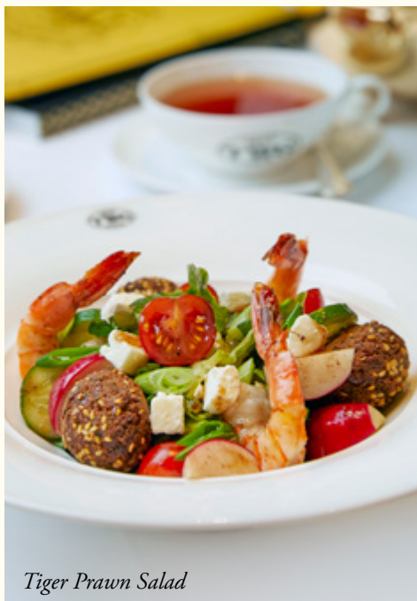
Tiger Prawn Salad