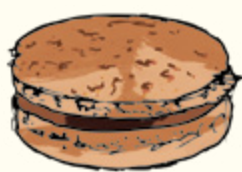
Earl Grey Fortune & Chocolate