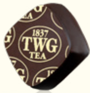
1837 Black Tea, Dark Chocolate Ganache