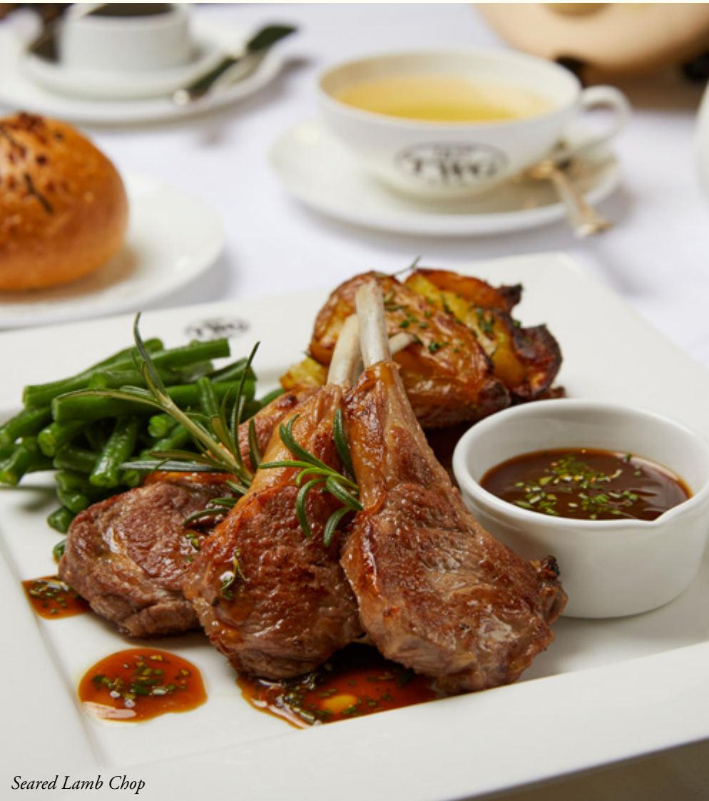
Seared Lamb Chop

Seared New Zealand lamb chop accompanied by green beans and smashed potatoes, served with a Houjicha infused black garlic and rosemary lamb jus.