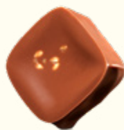
Miraculous Mandarin Tea, Sesame & Honey