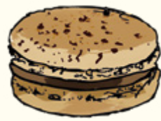
Number 12 Tea & Tiramisu