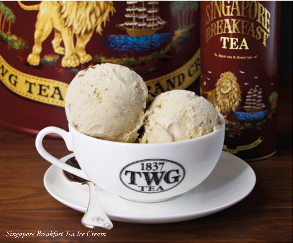
Singapore Breakfast Tea Ice Cream