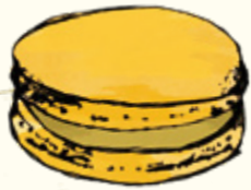
Lemon Bush Tea