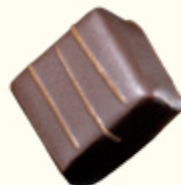
Napoleon Tea & Caramel

Only available at TWG Tea Salons & Boutiques at MBS on the Bay, Takashimaya B2 and Changi T4