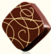
Lemon Bush Tea, White Chocolate Ganache