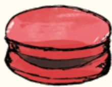
1837 Black Tea & Blackcurrant