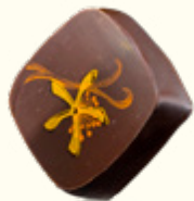
Vanilla Bourbon Tea & Dark Chocolate