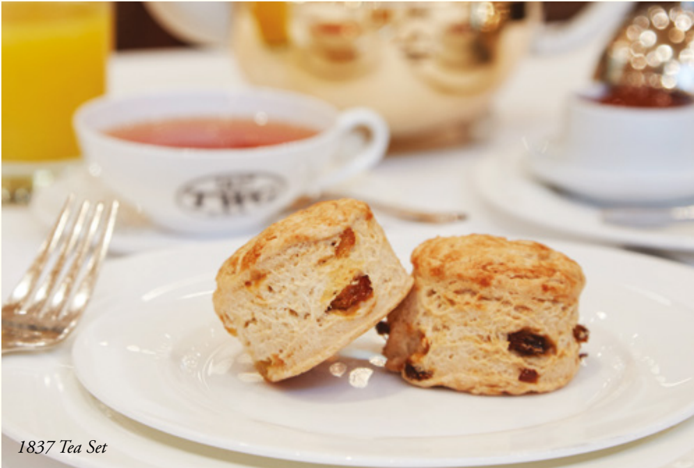
1837 Tea Set