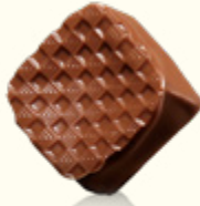
Brothers Club Tea, Maple Syrup & Pecan