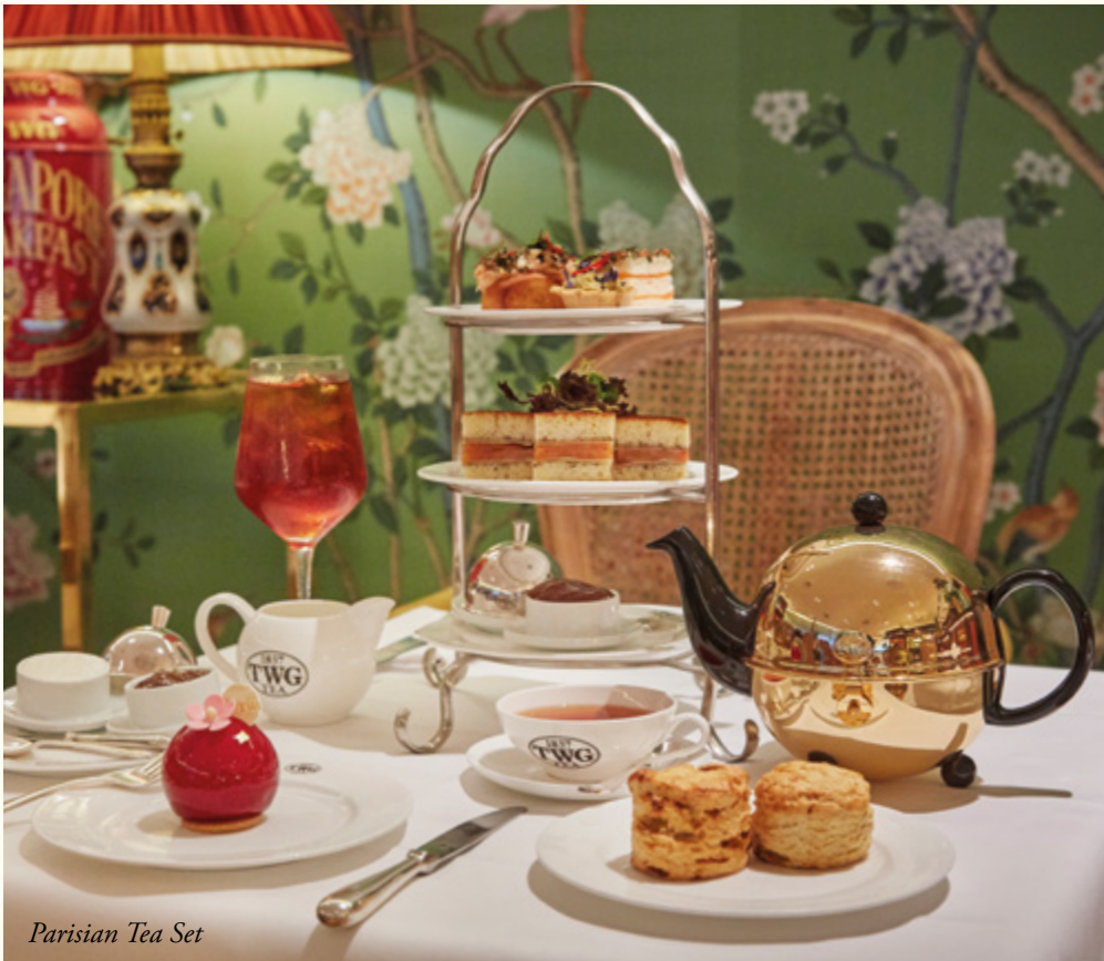
Parisian Tea Set