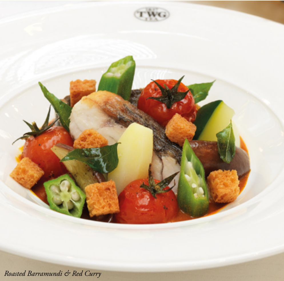
Roasted Barramundi & Red Curry

Pan-roasted barramundi fillet accompanied by a hearty coconut milk and tomato base curry infused with Mistral Tea, served with okra, zucchini, baby eggplant, steamed potatoes and cherry tomatoes, topped with deep fried curry leaves and bread croutons.