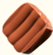
African Ball Tea, Peanut & Salted Caramel