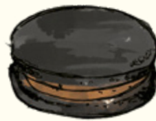
Napoleon Tea & Caramel