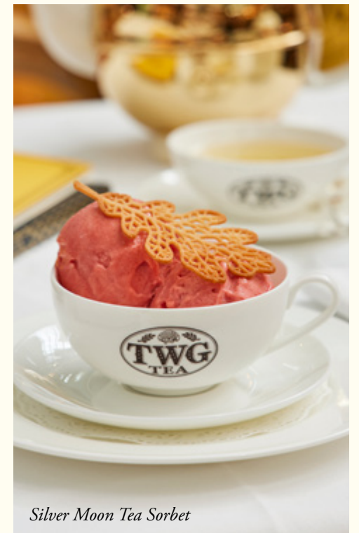
Silver Moon Tea Sorbet