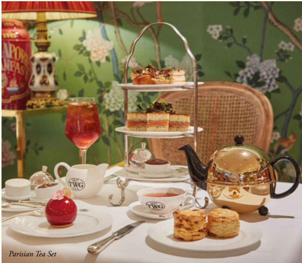
Parisian Tea Set