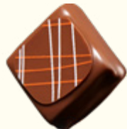
Polo Club Tea, Chestnut & Apricot