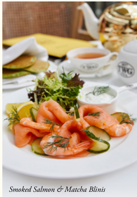
Smoked Salmon & Matcha Blinis