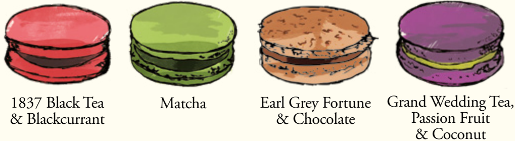
1837 Black Tea & Blackcurrant