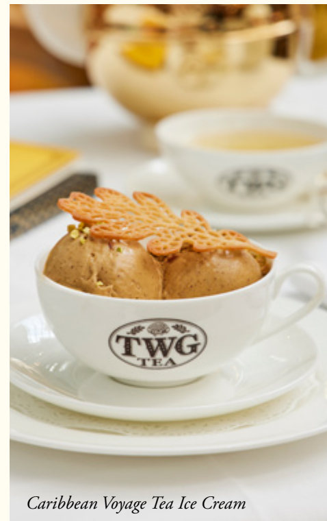
Caribbean Voyage Tea Ice Cream