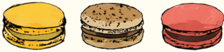
Lemon Bush Tea