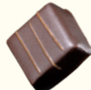
Napoleon Tea & Caramel

Only available at TWG Tea Salons & Boutiques at MBS on the Bay, Takashimaya B2 and Changi T4