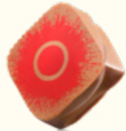
1837 Green Tea, Raspberry & Caramel