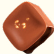
Miraculous Mandarin Tea, Sesame & Honey