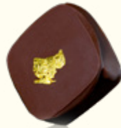
Earl Grey Fortune, Dark Chocolate Ganache