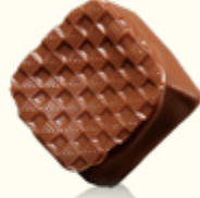
Brothers Club Tea, Maple Syrup & Pecan