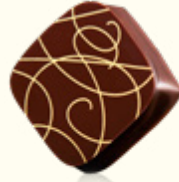
Lemon Bush Tea, White Chocolate Ganache