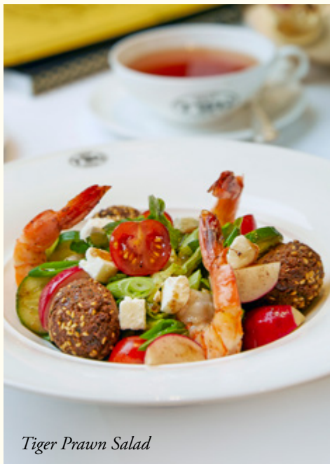
Tiger Prawn Salad