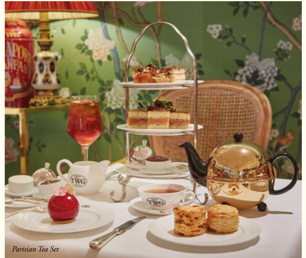
Parisian Tea Set