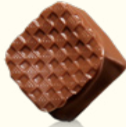
Brothers Club Tea, Maple Syrup & Pecan