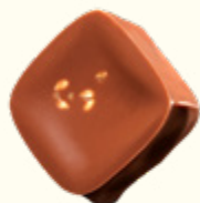
Miraculous Mandarin Tea, Sesame & Honey