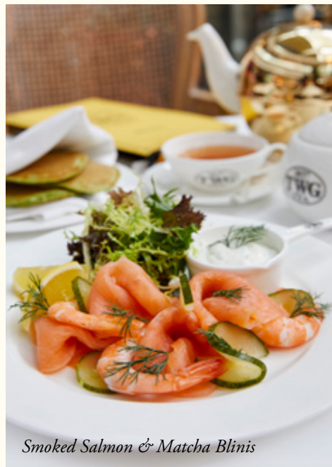
Smoked Salmon & Matcha Blinis