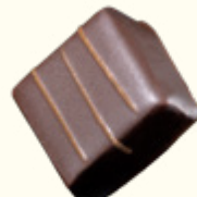
Napoleon Tea & Caramel

Only available at TWG Tea Salons & Boutiques at MBS on the Bay, Takashimaya B2 and Changi T4