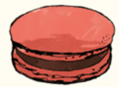
Bain de Roses Tea