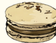
Vanilla Bourbon Tea & Blackcurrant