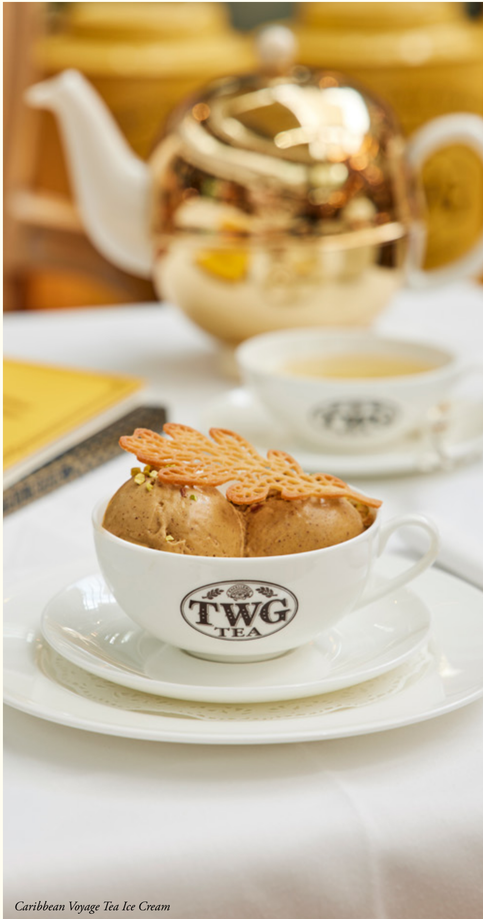
Caribbean Voyage Tea Ice Cream