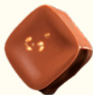
Miraculous Mandarin Tea, Sesame & Honey