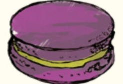
Grand Wedding Tea, Passion Fruit & Coconut