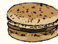
Number 12 Tea & Tiramisu