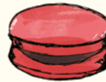
1837 Black Tea & Blackcurrant