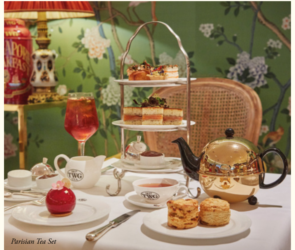
Parisian Tea Set