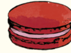
Silver Moon Tea & Strawberry