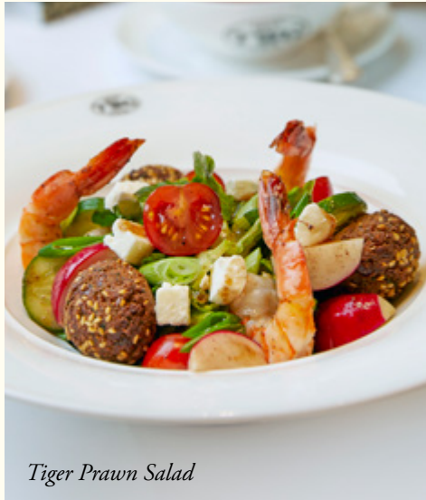
Tiger Prawn Salad