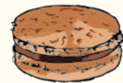
Earl Grey Fortune & Chocolate