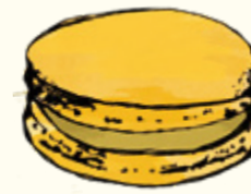
Lemon Bush Tea