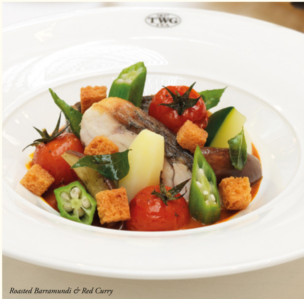
Roasted Barramundi & Red Curry