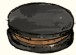
Napoleon Tea & Caramel