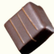
Napoleon Tea & Caramel

Only available at TWG Tea Salons & Boutiques at MBS on the Bay, Takashimaya B2 and Changi T4