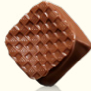
Brothers Club Tea, Maple Syrup & Pecan