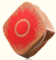
1837 Green Tea, Raspberry & Caramel