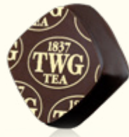
1837 Black Tea, Dark Chocolate Ganache