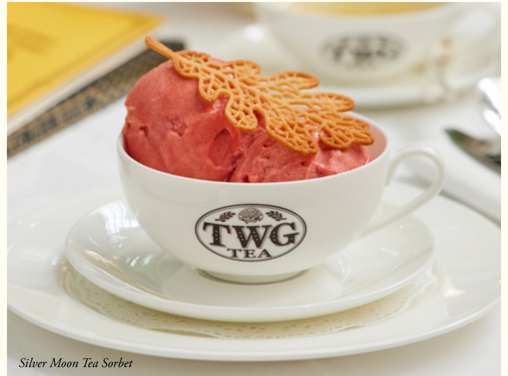
Silver Moon Tea Sorbet