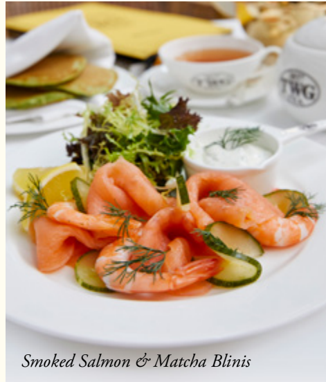
Smoked Salmon & Matcha Blinis